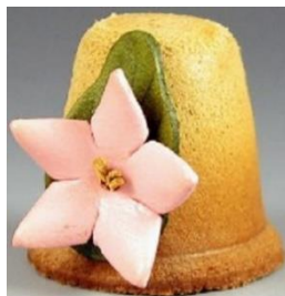
Nova Scotia Mayflower