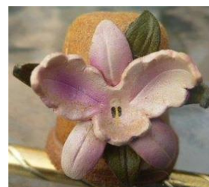
Orchid - pink