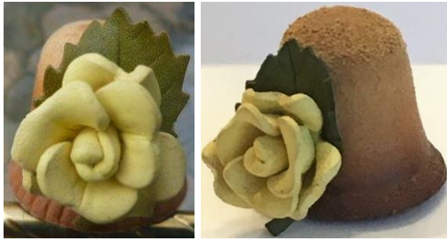
yellow bigger leaf