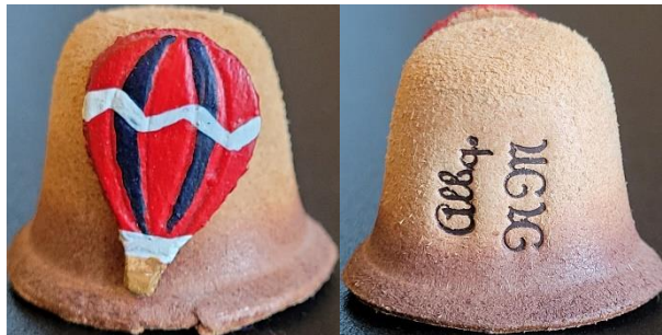
Albuquerque Balloon Festival 'Albq. NM'