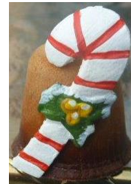
Christmas - Candy Cane