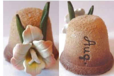
Gladioli lettered "Aug." as Flower of the Month