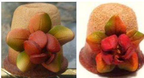
Newfoundland Pitcher Plant