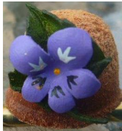
Yukon Territories Fireweed