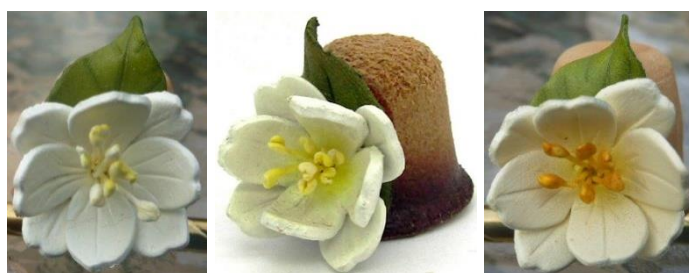
Northwest Territories Mountain Avens