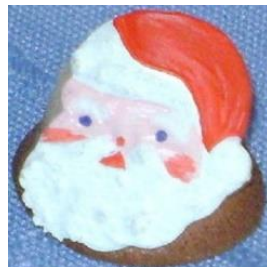
Christmas - Santa