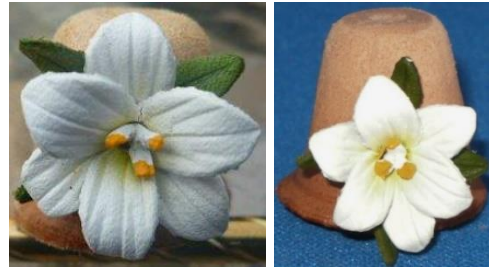
Quebec Madonna Lily