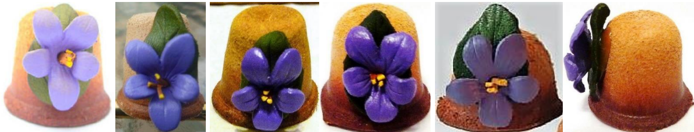
New Brunswick Purple violet