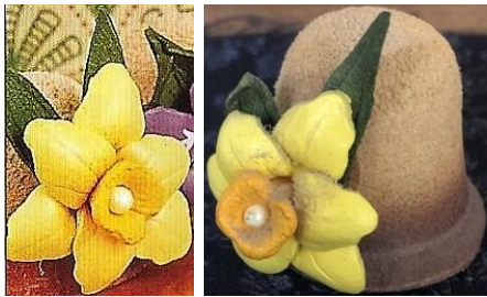
Daffodil with pearl at centre