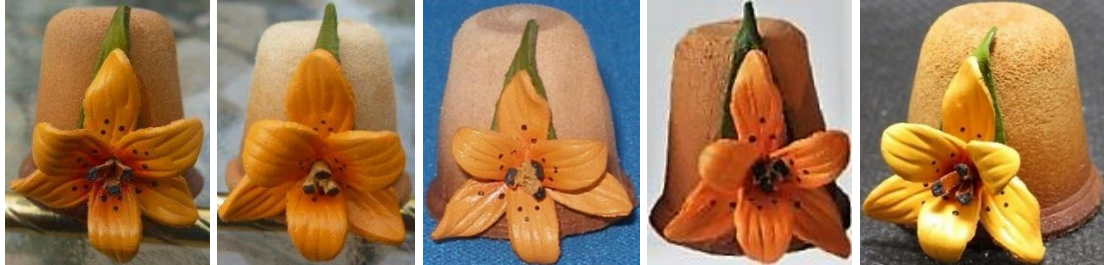
Saskatchewan Prairie Lily