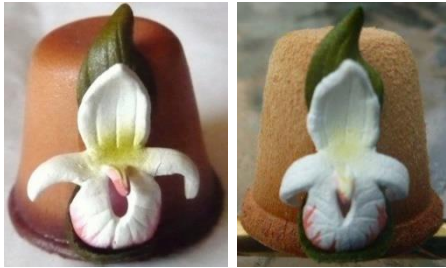
Prince Edward Island Lady Slipper