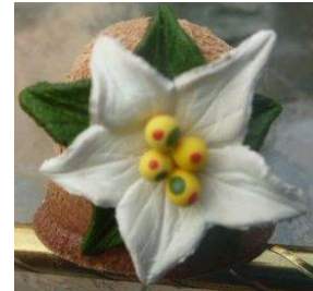
Poinsettia - White