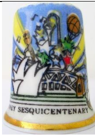
Birchcroft fine bone china Pan Arts of Sydney commissioned these thimbles for Sydney's Sesquicentenary (1847-1992) late 1990s part of Pan Arts Collectables Australia Series No. 28 1992