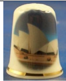
Birchcroft fine bone china