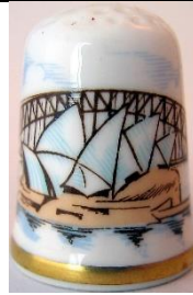
Caverswall England china from Capital cities of Australia set features NSW's waratah on the verso 1980s