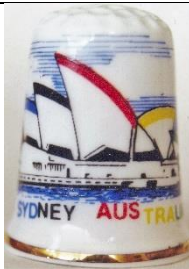
Pan Arts Collectables bone china Australia Series No. 35 produced when Sydney won Olympics, using the Olympic colours 1990s