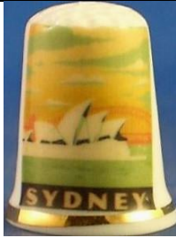
Birchcroft fine bone china 'Sydney' travel poster