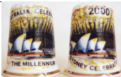
Pan Arts Collectables bone china Australia Series No. 40-41 (not lettered on thimbles) pair of similar thimbles Left: Australia celebrates the Millennium Right: Sydney celebrates 2000 2000