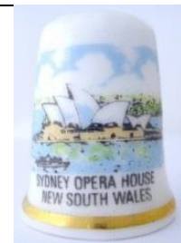
Ken Parry bone china part of Pan Arts Collectables Australia Series No. 5 mid 1980s