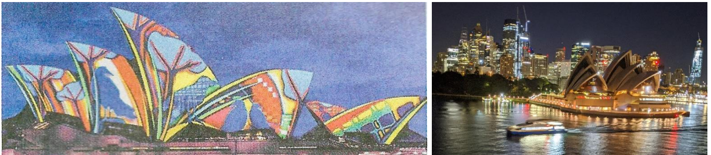
Sydney Opera House – Songlines 2016 | Sailing into Sydney Harbour at dawn March 2020

I have grouped the thimbles in the order that they appear in my book (ie by what they are made of). As I don't own all of these thimbles, if you have better or clearer photos, please share.