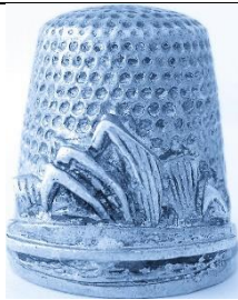
Zygmunt Libucha Brisbane sterling silver 1980s