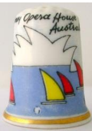
Pan Arts Collectables bone china Special Series No. 1 (not lettered on thimbles) commissioned by the Opera House shop mid 1980s