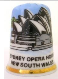
Pan Arts Collectables bone china Australia Series No. 20 1980s