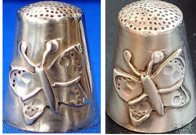
1986 London handmade with applied butterfly