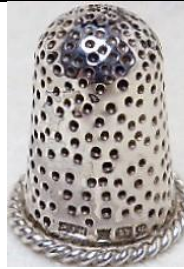
1986 Birmingham hand indented