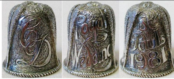
1981 London CD Royal Wedding St Paul's 1981