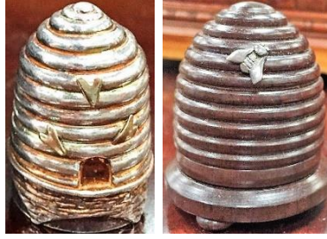
1988 London beehive-shaped with applied bees wooden thimble holder with an applied bee