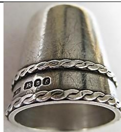
1979 London two distinctive Celtic twisted bands