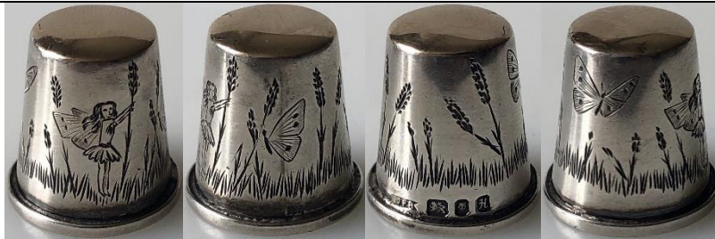
1982 London etched fairy amongst grass stalks with butterflies smooth apex