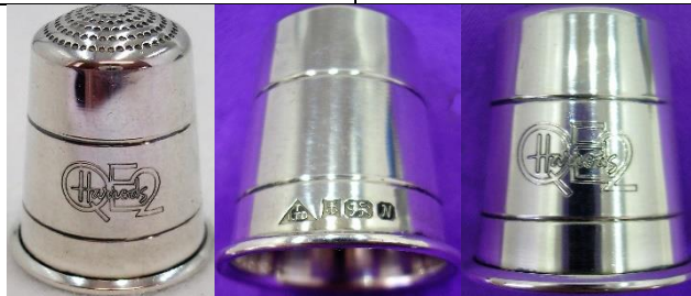
1987 Birmingham HARRODS lettered over QE2 (Cunard cruise liner)