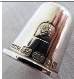
2002 925 London commemorating Queen Elizabeth's golden jubilee