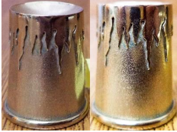
1982 Sheffield gilt applied abstract design concave apex smooth