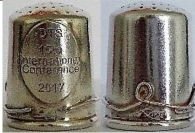
DTS International Conference 2017 (Dorset Thimble Society) not assayed