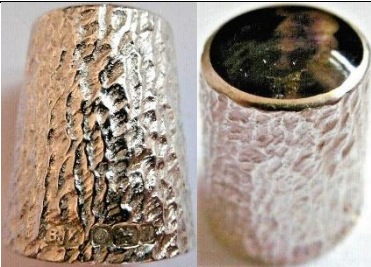
1987 Sheffield Blue John