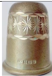
1985 Birmingham marriage of Prince Andrew to Sarah Ferguson 1986 peep in apex by Woodsetton