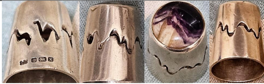
1984 Sheffield Blue John