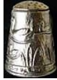
1984 Birmingham Easter 1984 swimming ducks