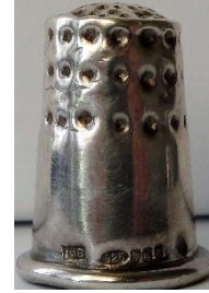
1999 925 Edinburgh millennium mark