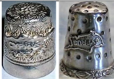
925 Cyprus not assayed R: name lettered upside down - may not be British made