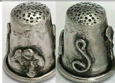
1979 London applied crude figures crudely hand-indented