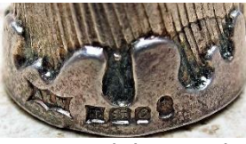
1977 L: jubilee mark Birmingham