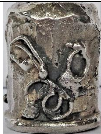
1972 Birmingham rough finish with abstract applied designs