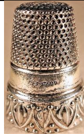
1987 925 Birmingham import mark made in Portugal