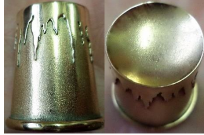
1982 Sheffield 9ct