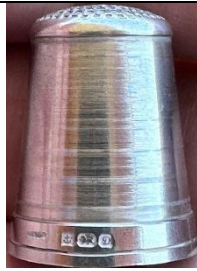
1979 Birmingham plain brushed surface mark poorly struck