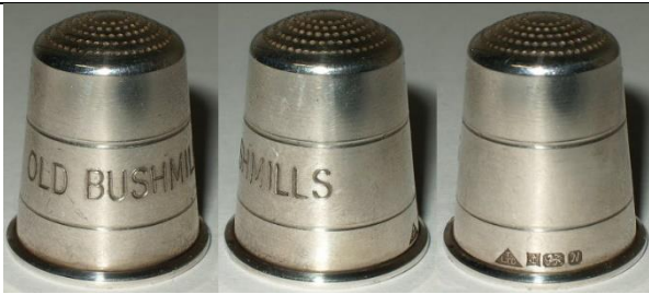
1987 Birmingham OLD BUSHMILLS