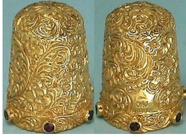
1978 9ct - 9.375 London garnets set in around rim