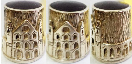
1993 Sheffield Whitby Abbey Whitby jet in apex see also: Ralph Weston