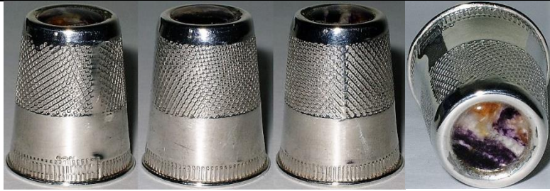
1999 925 Birmingham Blue John stone in apex very tiny mark