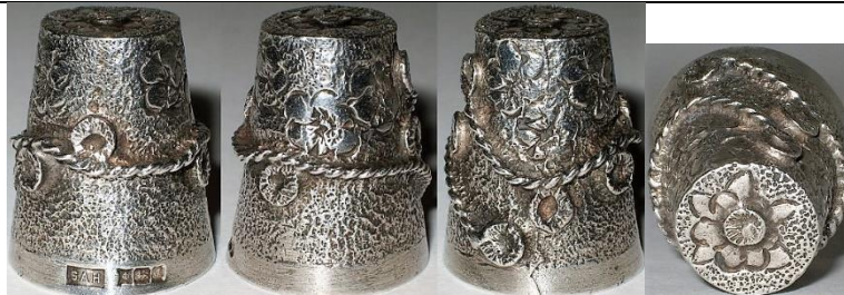
1975 Birmingham applied stylised flowers on stippled surface