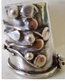
London applied stylised flowers with pearls