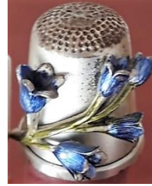
1995 London import mark applied bluebells made by Julius Wengert of Pforzheim Germany