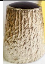
1989 Sheffield Onyx