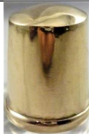
1987 9ct - 9.375 Birmingham