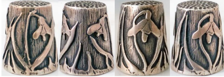
1989 Birmingham applied daffodils