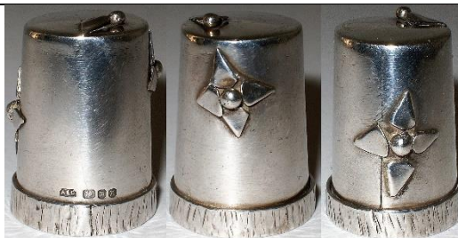
1984 London applied stylised flower on smooth sides