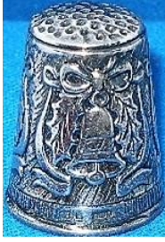
1981 Birmingham Christmas 1981 with bell and holly