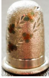
1985 Birmingham enamelled flowers on finely stippled ground