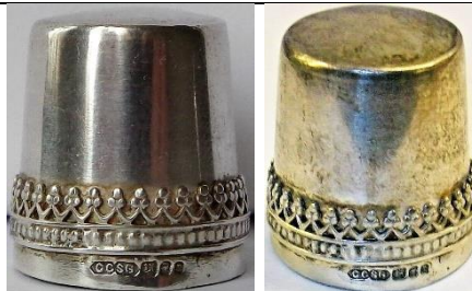
1970/1977 London large sized thimbles no indentations on flat apex