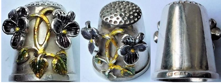
1995 London import mark enamelled applied pansies made by Julius Wengert of Pforzheim Germany