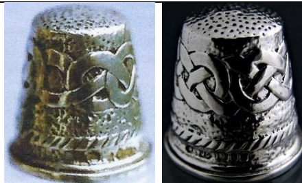
1978 London Celtic knot