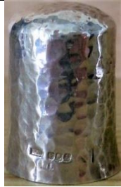
1983 Edinburgh hand beaten surface