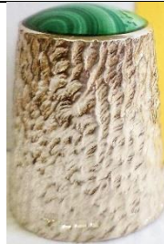
1989 Sheffield Malachite