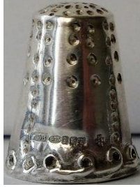
1999 925 Edinburgh millennium mark piercings along rim