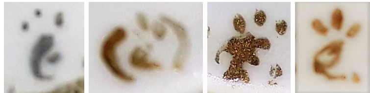
some extra prints

Initially the apexes remained blank or were painted in monochrome colours, but gradually the designs crept partially onto the tops and then they filled the tops in glorious bold colours.