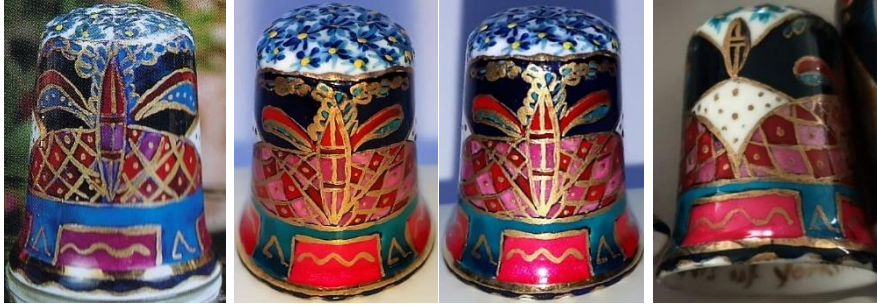
The Star of Atum