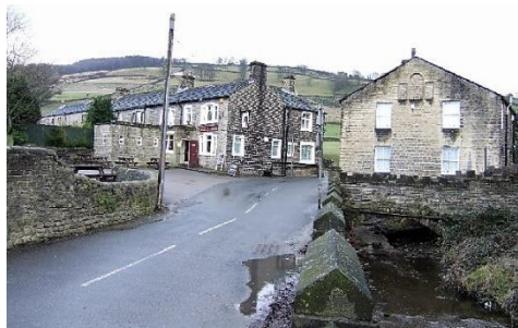
Sutton-in-Craven in North Yorkshire

Jasper’s was situated in a village Sutton-in-Craven in North Yorkshire, in the UK.