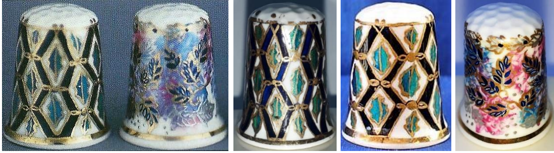
The Christmas Ice King – The Christmas Ice Queen