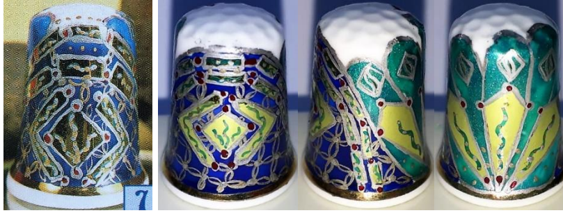
The 'three cornered hat'