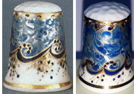
Discovery of a new comet