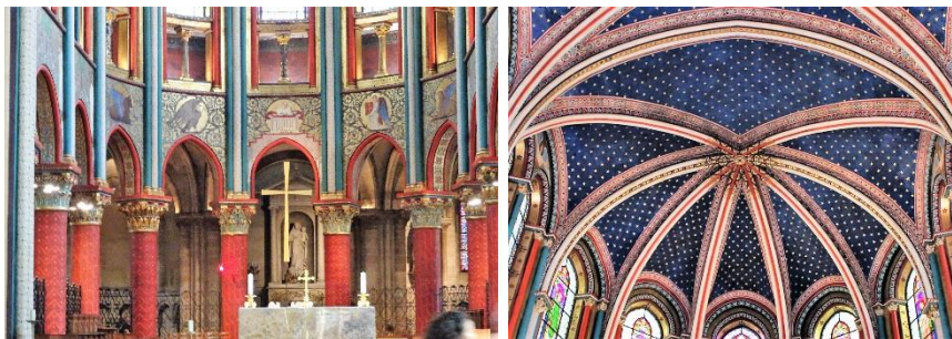
Église de Saint Germain des Prés

If you have access to the catalogues mentioned, you will see examples of pastel thimbles. In reality, once I saw images of the actual thimbles, I was stunned by their strong, rich jewel colours. I was instantly taken back to Paris in 2018 – to the breathtaking splendour of the Église de Saint Germain des Prés, which has had its original mediaeval colours restored.