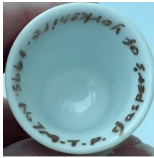
gilded lettering – “Jasper’s of Yorkshire 1995 No.7 M. T.P.”