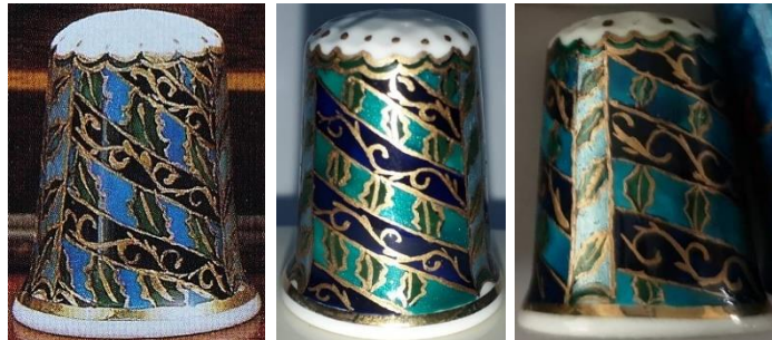
The merry Mummers