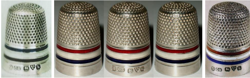
thimbles with no lettering were produced to commemorate coronation of Edward VIII (which never took place)

Charles Horner Chester - 1936 sizes 5, 8, 9