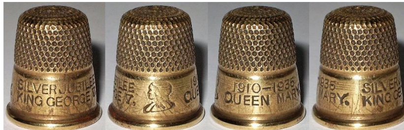
Silver Jubilee 1910-1935 King George V Queen Mary

'Silver' is lettered on the rim below the busts this is one of the scarcest thimbles by Iles & Gomms as they rarely created silver thimbles the lettering on the thimbles is the same as the 'Silver' sticky label with the celluloid box the celluloid box was also made by Iles & Gomms