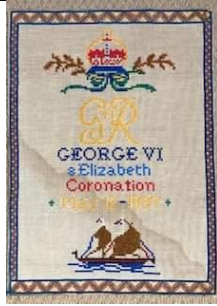
sampler stitched for coronation