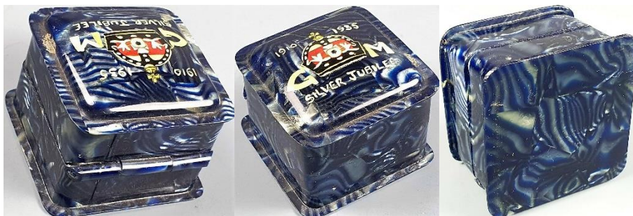
box lettered: 1910-1935 GM Silver Jubilee red and gold crown Iles & Gomms celluloid square thimble box