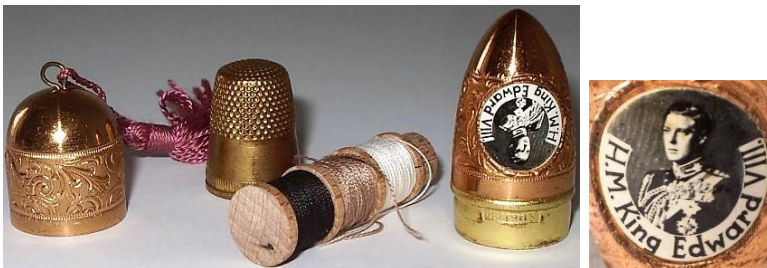
H.M. King Edward VIII. paper portrait in a raised roundel Settmacher tombac bullet-shaped sewing kit