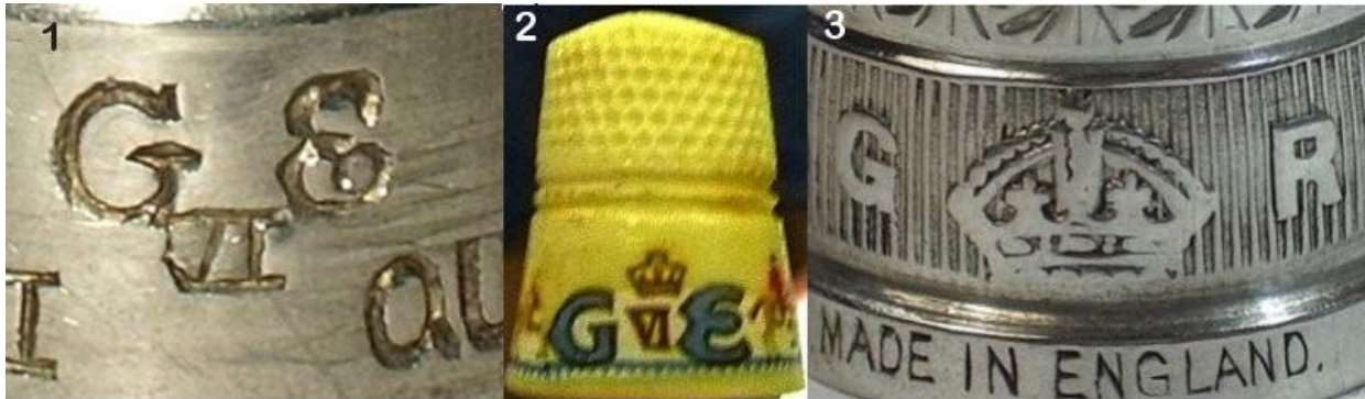
1) GE VI - Iles Nickel Silver. 2) GE VI - Iles Plastic. GE = George & Elizabeth 3) GR for Georgius Rex - Henry Griffith & Sons

I will only feature thimbles made during this period. Many were made in the 1980s for the collectables market. They are outside the scope of this topic.