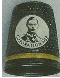
Coronation 1937 paper portrait in a raised roundel George VI only Settmacher oxidised brass yellow lacquered groove