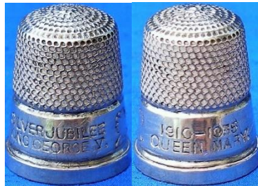
Silver Jubilee 1910-1935 King George V. Queen Mary. a crown nickel Iles & Gomms flat rim