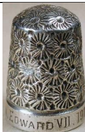
Edward VII 1902