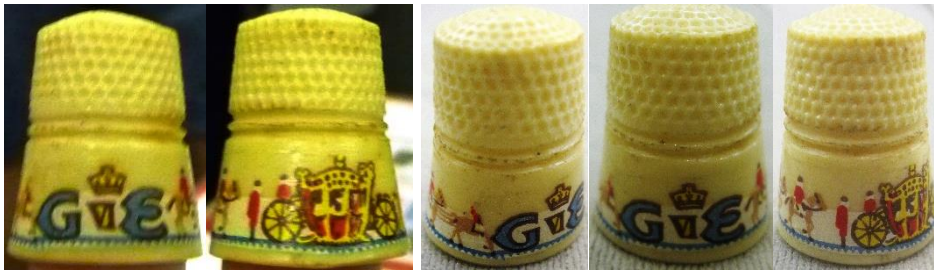
G V I E decaled scene with Coronation coach with George VI's royal cypher Iles & Gomms ivorine blue wavy line