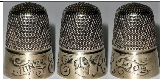
June 1902 bust of Edward between ER Charles Iles brass the coronation was scheduled for 26 June 1902 but owing to the King's illness it was postponed to 9 August 1902