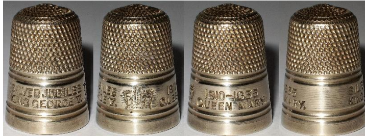
Silver Jubilee 1910-1935 King George V. Queen Mary. a crown Iles & Gomms no rolled rim