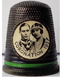
Coronation 1937 paper portraits in a raised roundel Settmacher oxidised brass yellow or green lacquered grooves