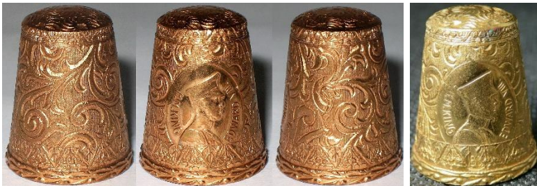
H.M. King Edward VIII. portrait in a cameo Settmacher engraving all over tombac reeded rim

Charles Horner Chester - 1936 sizes 5, 8, 9