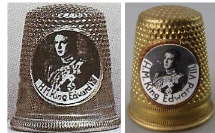
H.M. King Edward VIII. paper portrait in a raised roundel Settmacher L: zinc - R: brass