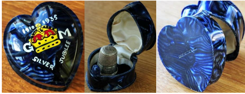
box lettered: 1910-1935 GM Silver Jubilee red and gold crown Iles & Gomme celluloid heart-shaped thimble box Made in England lettered on base