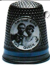
His Majesty the King The Queen paper with portraits in a raised roundel Settmacher oxidised brass blue lacquered groove