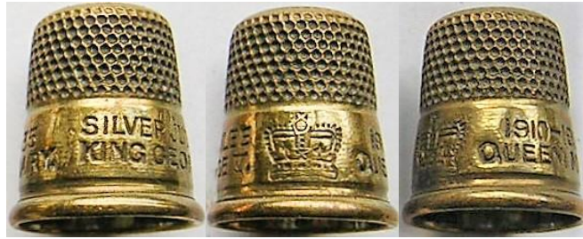
Silver Jubilee 1910-1935 King George V. Queen Mary.