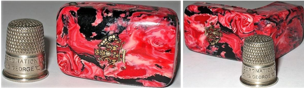
box lettered: HM 1937 gold crown Iles & Gomms celluloid rectangular thimble box