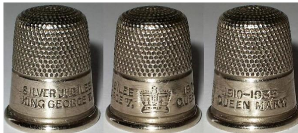
Silver Jubilee 1910-1935 King George V. Queen Mary. a crown Iles & Gomms nickel rolled rim