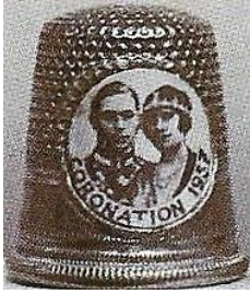
Coronation 1937 paper with portraits in a raised roundel Settmacher