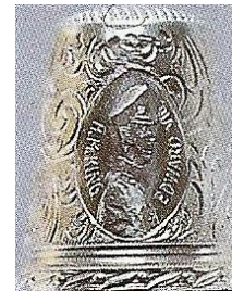
H.M. King Edward VIII. portrait in a cameo Settmacher engraving all over silver-plated reeded rim