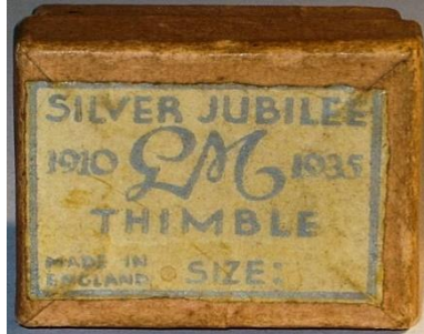
Silver Jubilee 1910-1935 King George V. Queen Mary. bust portraits Iles & Gomms nickel rolled rim box lettered: Silver Jubilee 1910 GM 1935 Thimble Made in England Size 2