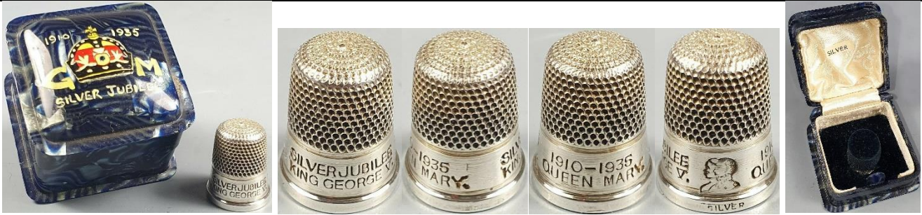
Silver Jubilee 1910-1935 King George V. Queen Mary.

bust portraits Iles & Gomms silver flat rim