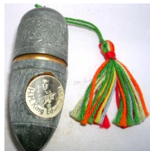
H.M. King Edward VIII. paper portrait in a raised roundel Settmacher nickel bullet-shaped sewing kit