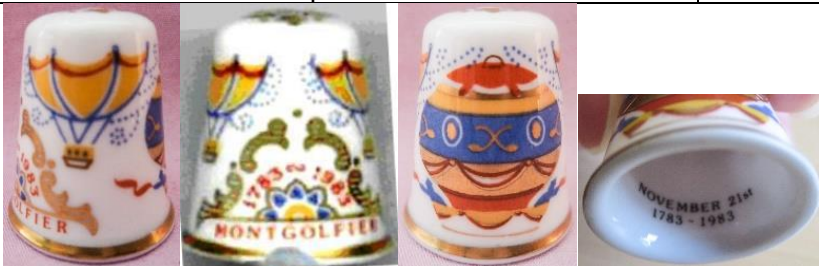
Montgolfier Brothers bicentenary of flight November 21 st 1783-1983 special gold trefoil patterned apex apex 3