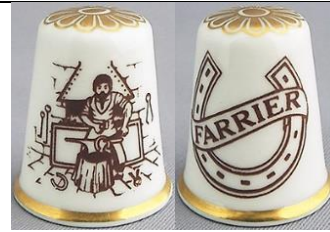
'Farrier' horse shoe