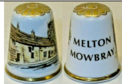
'Melton Mowbray' this scene shows the local church & The Anne of Cleves public house apex 2