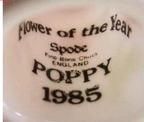
Poppy 1985 apex 2