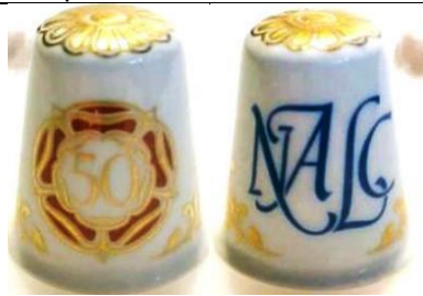
'NALC 50' National Association of Ladies Circles apex 2 limited to 1000