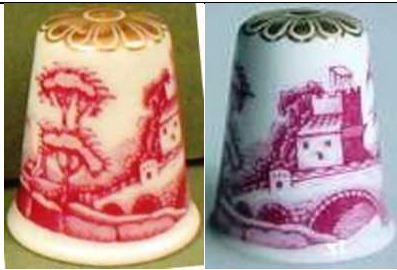
'Traditional' - red