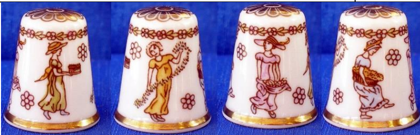
Floral girls four scenes apex 2