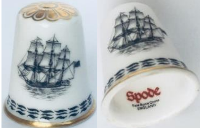
Trade Winds – a Sailing ship monochrome black with stylised waves in rows at rim apex 2