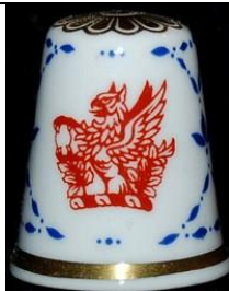
Hallmarked Thimbles of the World's Great Porcelain Houses 1985 apex 2 from set of 50