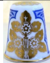
Yorkshire rose apex 2 does this belong in a series?