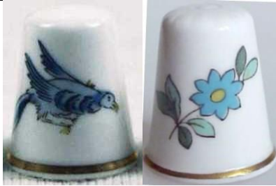
'Mulberry' blue bird with blue flower on verso apex 1

in 2013, a previously unrecorded version exists where body is ridged with a stepped band similar to the Spode cherubs thimbles