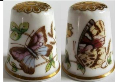
tropical butterflies apex 2