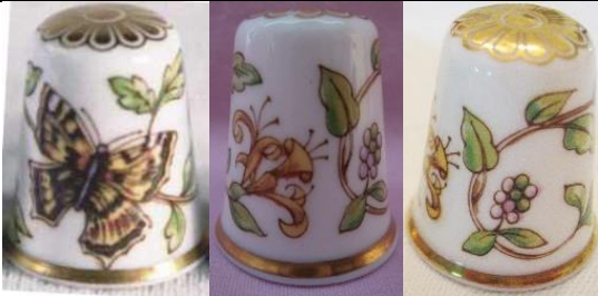
English butterflies apex 2