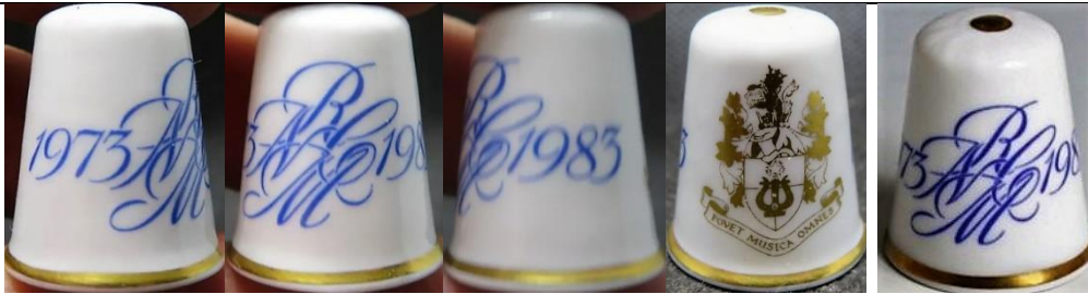
10th Anniversary of The Royal College of Music 1973-1983 'Fovet musica omnes' lettered on coat-of arms apex 4b