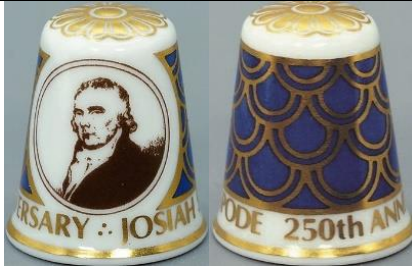
250th Anniversary of Spode 1976 apex 2

these thimbles are all dated and arranged by date of issue