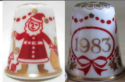
1983 apex 2