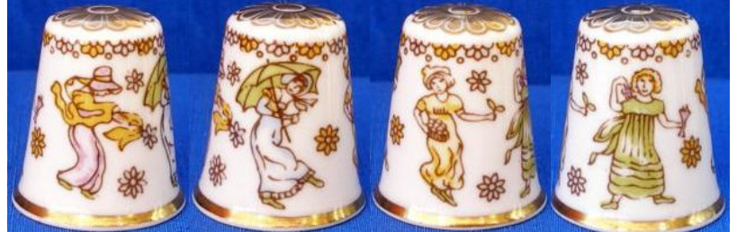
Umbrella girls four scenes apex 2