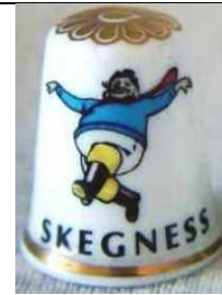
'Skegness' The Jolly Fisherman this poster figure has become the emblem of the town bright primary colours apex 2