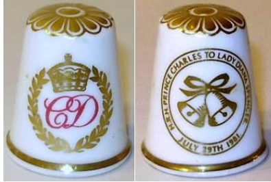
H.R.H. Prince Charles to Lady Diana Spencer...1981 Royal Wedding apex 2