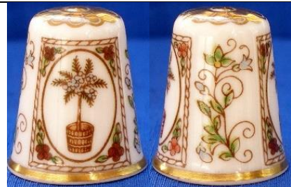
Palms in two cameos apex 2