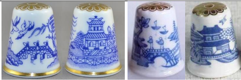
willow pattern with and without gold rim