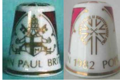
Visit of Pope John Paul to England 1982 apex 5