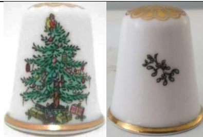
1986 apex 2