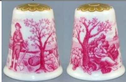
The Woodman apex 2 no gold rim does this belong in a series?