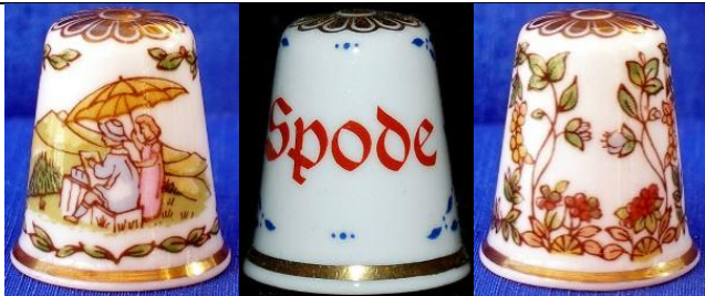
Painting apex 2