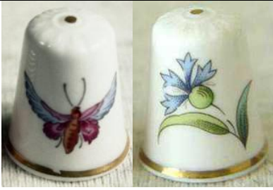
Butterfly 1993 apex 4b