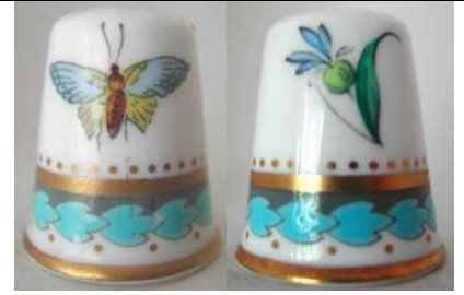
'Trapnell' blue & yellow butterfly turquoise band apex 1