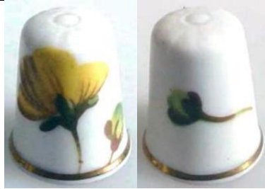
'Summer Meadow' buttercup 1980 apex 1