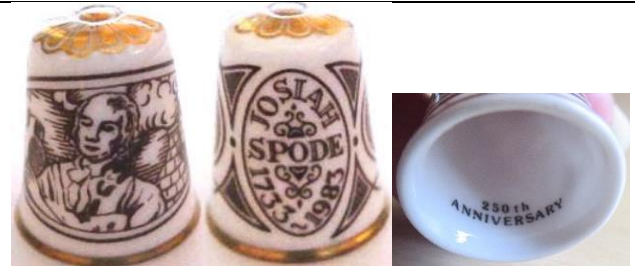
250th Anniversary of Spode 1733-1983 apex 2