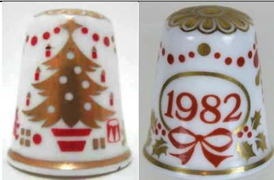
1982 apex 2