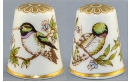
Tropical birds apex 2