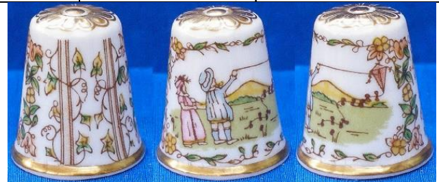
Kite flying trailing ivy on verso apex 2