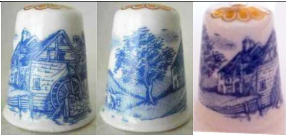
'Blue Italian' - blue

Spode traditional red & blue dinner service patterns from hand engravings the design wraps around the thimble apex 2 no gold rim