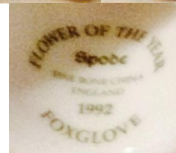
Foxglove 1992 apex 1