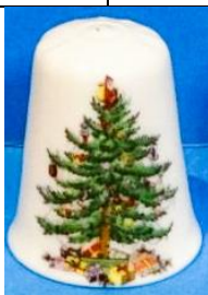
undated apex 1 no painted rim