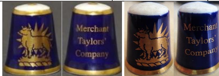
'Merchant Taylors' Company' L: apex 8 – R: apex 1 – no upper gold rim see the same design (1989) by Halcyon Days in Modern British enamelled thimbles topic