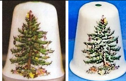
undated apex 4a no painted rim