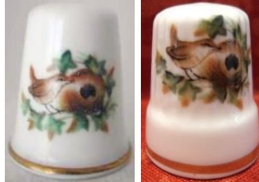
bird & nest on both sides apex 1

in 2013, a previously unrecorded version exists where body is ridged with a stepped band similar to the Spode cherubs thimbles