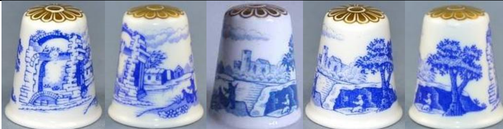
'Traditional' - blue