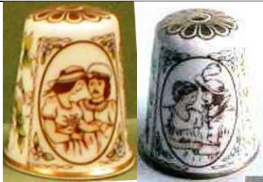
Couples in two cameos apex 2