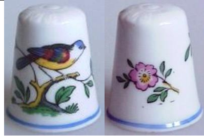
colourful bird with pink flower on verso blue rim apex 1