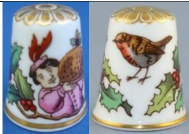
1985 apex 2