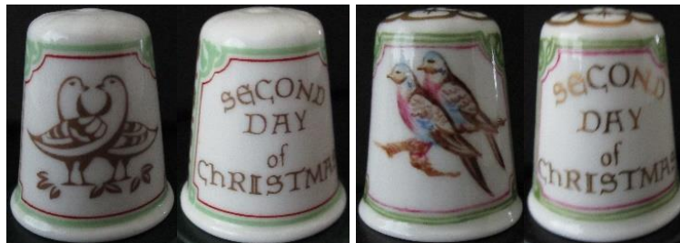
2 turtles doves

There is more than one version of one of this set – with apex 1 with different images altogether