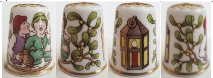
1984 apex 2