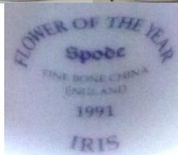
Iris 1991 apex 1