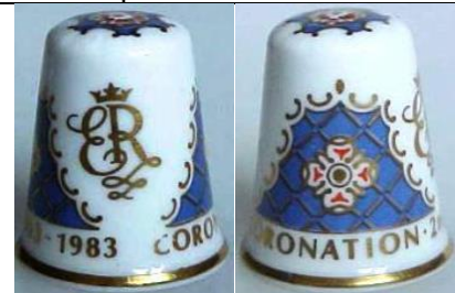
30th anniversary of Queen Elizabeth's Coronation 2nd June 1953-1983 apex 6