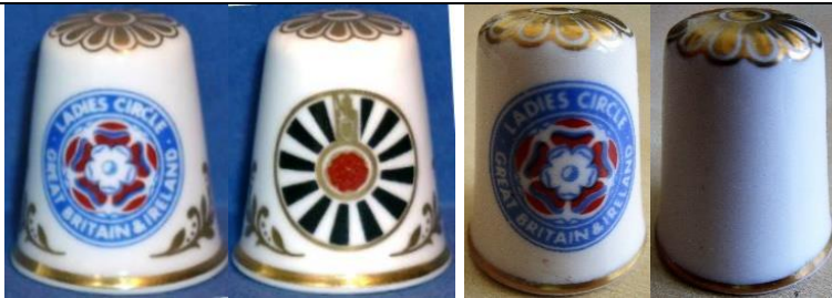
'Ladies Circle Great Britain & Ireland' the Round Table emblem limited to 500 L: apex 2 – R: no emblem on verso

these are not commemorative thimbles as they are not dated