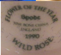
Wild Rose 1990 apex 2