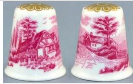
'Blue Italian' - red