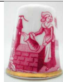
'Girl at Well' Franklin Mint's Porcelain Houses of the World 1980 from set of 25 apex 1