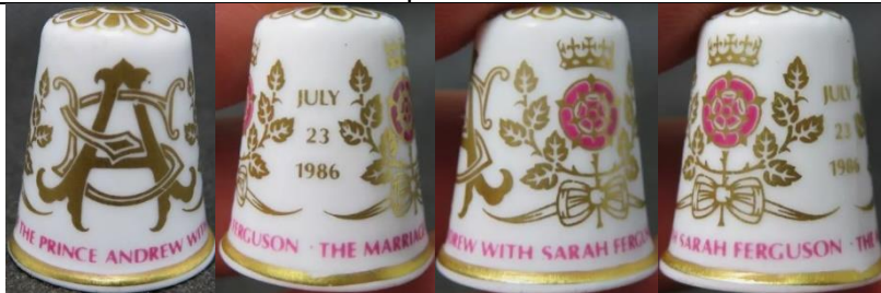
Prince Andrew to Sarah Ferguson Royal wedding July 23 1986 apex 2