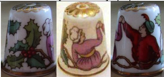
1983 apex 2