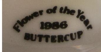
Buttercup 1986 apex 2 see other versions below