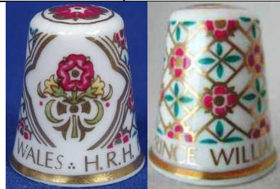
H.R.H Prince William of Wales 4 August 1982 inside apex 8