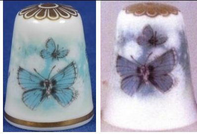
'Dandelion Clocks and Butterflies' or 'Butterflies and Dandelions' apex 2 issued by Thimble Collectors Club R: no gold band version