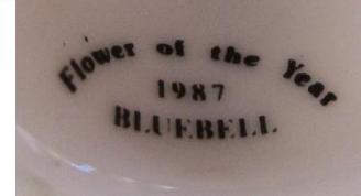
Bluebell 1987 apex 2