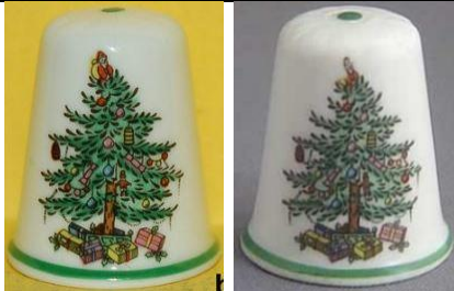
1986 green rim apex 4a ironstone