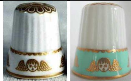
Cupids or cherubs pair white and turquoise bands note that the body is ridged with a stepped band apex 2 1977