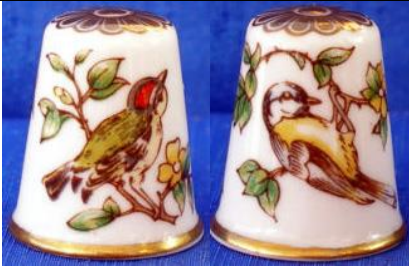
English birds apex 2