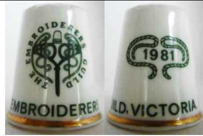
Victoria Embroiderers Guild (Australia) 1981 apex 1