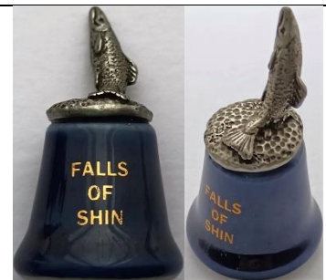
Fish speckled plinth of salmon 'Falls of Shin'