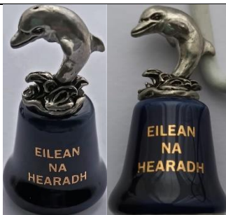
Dolphin splash plinth 'Eilean na Hearadh' (name of a guesthouse)