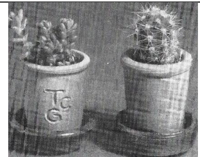
Pots red plant pots 'TCG' pots even have drainage holes TTG April 1985 b&w photo