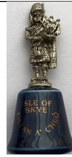
Bagpiper 'Isle of Skye' 'Eilean a Cheo'