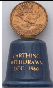
Coin genuine copper coin 'Farthing withdrawn Dec. 1960' limited to 450 TTG December 1985