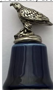
Eagle no lettering