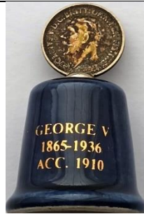
Coin genuine silver 3d coin 'George V 1865-1936 Acc. 1910' commemorating 50 years since his death TTG January 1986