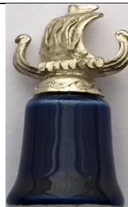
Ship waves plinth Viking longboat no lettering