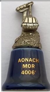
Gondola mountain plinth 'Aonach Mor 4006'