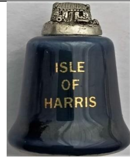
Croft 'Isle of Harris'