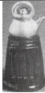
Kettle enameled copper base is black representing a stove no lettering TTG May 1985 b&w photo