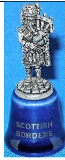
Bagpiper cobble plinth 'Scottish Borders'