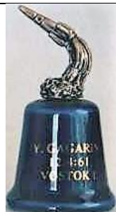
Rocket rubble depicting Earth plinth 'Y. Gagarin 4.12.61 Vostok 1'