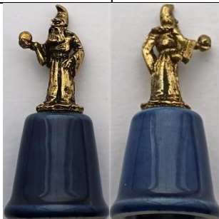
Merlin brass finish no lettering also available in silver 5 gold 1 TTG December 1985