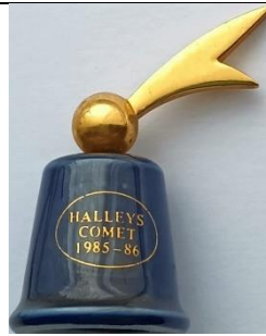
Halley's Comet gold-plated comet 'Halley's Comet 1985-86' lettered in elliptical shape of comet's path TTG November 1985'