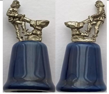
Young Arthur with Escalibur no lettering TTG March 1986