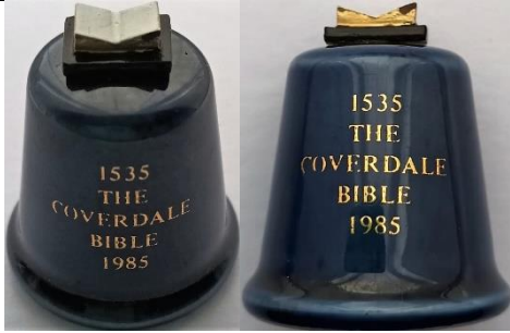
Book book is edged in gold '1535 The Coverdale Bible 1985' celebrating 450 years since its creation TTG October 1985