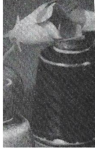
no lettering TTG July 1985 (shown in background) b&w photo