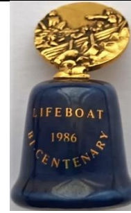
Lifeboat gold-plated medallion 'Lifeboat Bi-centenary 1986' TTG April 1986