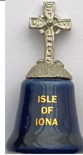
Celtic Cross raised mound plinth 'Isle of Iona'