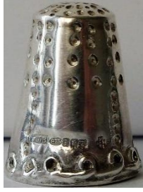
1999 925 Edinburgh millennium mark piercings along rim