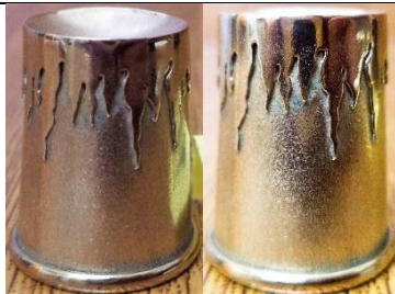
1982 Sheffield gilt applied abstract design concave apex smooth