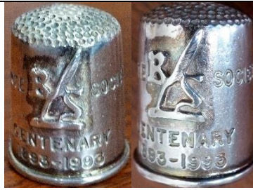
1993 Sheffield Bronte Society Centenary 1893-1993 B S separated by feathered pen