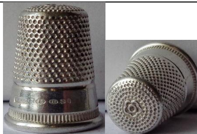
2002 925 London import mark