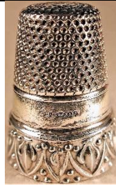
1987 925 Birmingham import mark made in Portugal