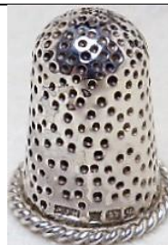
1986 Birmingham hand indented