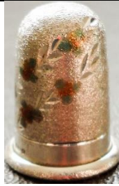
1985 Birmingham enamelled flowers on finely stippled ground