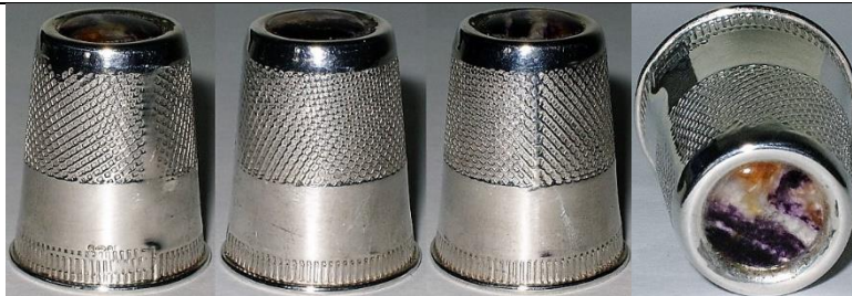
1999 925 Birmingham Blue John stone in apex very tiny mark