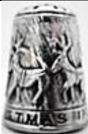
1982 Birmingham Christmas 1982 with reindeer