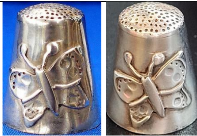
1986 London handmade with applied butterfly