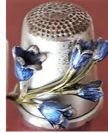
1995 London import mark applied bluebells made by Julius Wengert of Pforzheim Germany