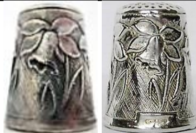
1982 Birmingham Easter 1982 with daffodils