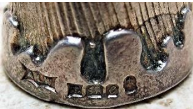
1977 L: jubilee mark Birmingham