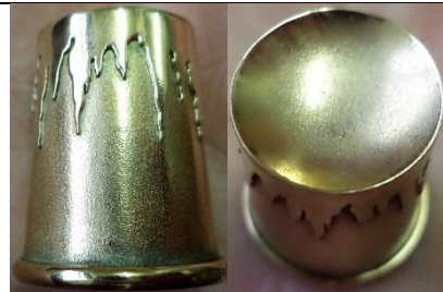
1982 Sheffield 9ct