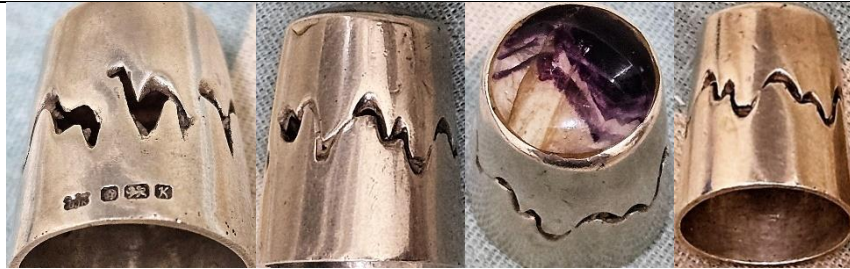
1984 Sheffield Blue John