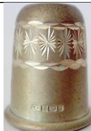
1985 Birmingham marriage of Prince Andrew to Sarah Ferguson 1986 peep in apex by Woodsetton