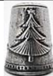
1984 Birmingham Christmas 1983 with stylised tree