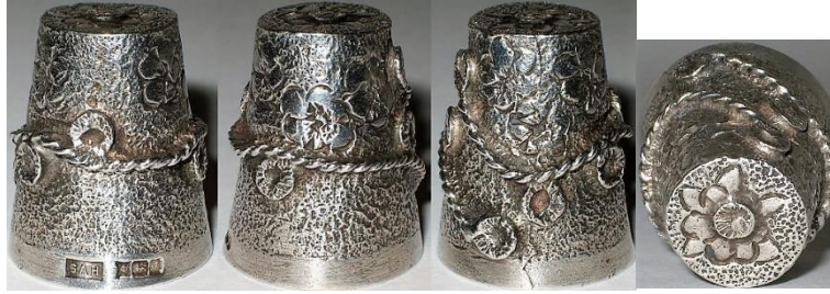
1975 Birmingham applied stylised flowers on stippled surface