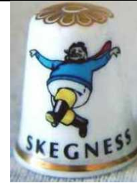
'Skegness' The Jolly Fisherman this poster figure has become the emblem of the town bright primary colours apex 2