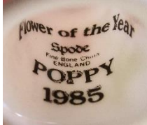
Poppy 1985 apex 2