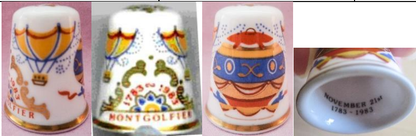
Montgolfier Brothers bicentenary of flight November 21 st 1783-1983 special gold trefoil patterned apex apex 3