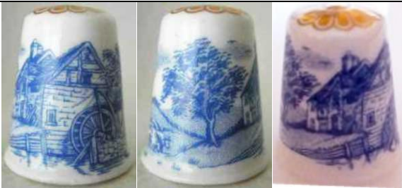
'Blue Italian' - blue

Spode traditional red & blue dinner service patterns from hand engravings the design wraps around the thimble apex 2 no gold rim