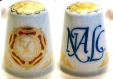
'NALC 50' National Association of Ladies Circles apex 2 limited to 1000