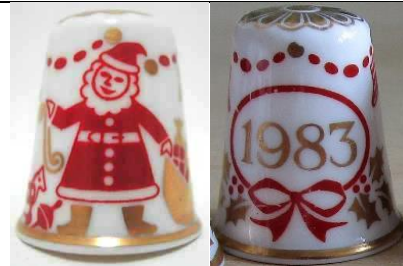
1983 apex 2