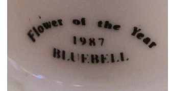
Bluebell 1987 apex 2