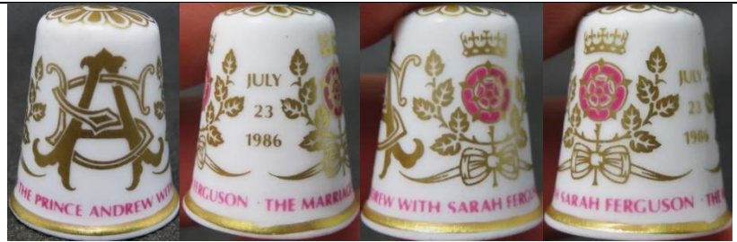
Prince Andrew to Sarah Ferguson Royal wedding July 23 1986 apex 2