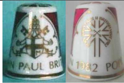
Visit of Pope John Paul to England 1982 apex 5