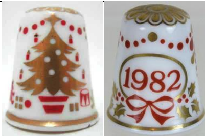
1982 apex 2