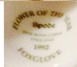
Foxglove 1992 apex 1