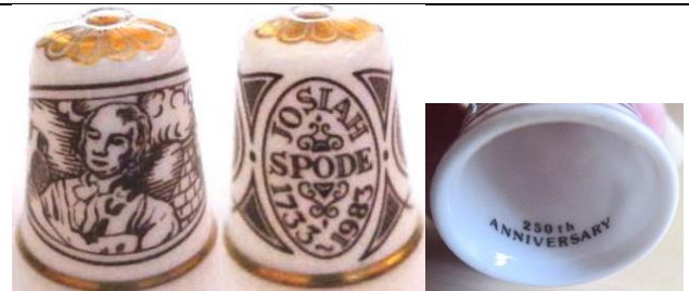
250th Anniversary of Spode 1733-1983 apex 2