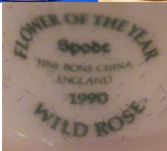
Wild Rose 1990 apex 2