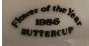
Buttercup 1986 apex 2 see other versions below