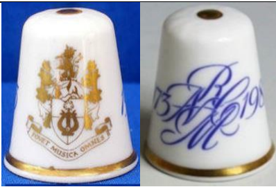
10th Anniversary of The Royal College of Music 1973-1983 apex 4b