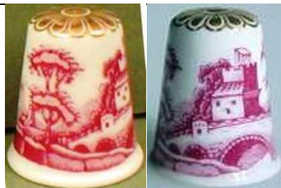
'Traditional' - red