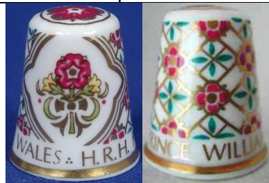
H.R.H Prince William of Wales 4 August 1982 inside apex 8