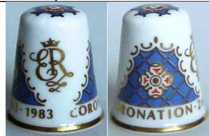
30th anniversary of Queen Elizabeth's Coronation 2nd June 1953-1983 apex 6