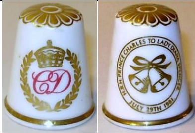
H.R.H. Prince Charles to Lady Diana Spencer...1981 Royal Wedding apex 2