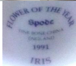
Iris 1991 apex 1