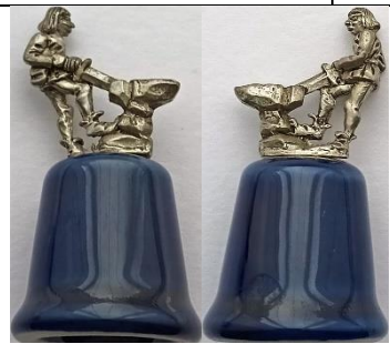
Young Arthur with Escalibur no lettering TTG March 1986