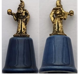
Merlin brass finish no lettering also available in silver 5 gold 1 TTG December 1985