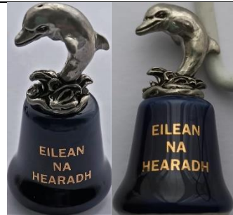
Dolphin splash plinth `Eilean na Hearadh' (name of a guesthouse)