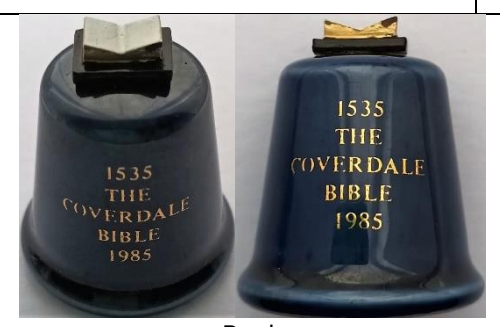
Book book is edged in gold '1535 The Coverdale Bible 1985' celebrating 450 yrears since its creation mahgany wooden plinth for book by Nick Kerr TTG October 1985