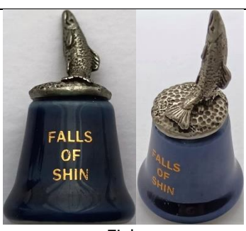
Fish speckled plinth of salmon 'Falls of Shin'