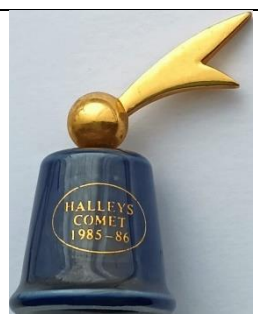
Halley's Comet gold-plated comet 'Halley's Comet 1985-86' lettered in elliptical shape of comet's path TTG November 1985